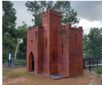
Old King Cole's castle